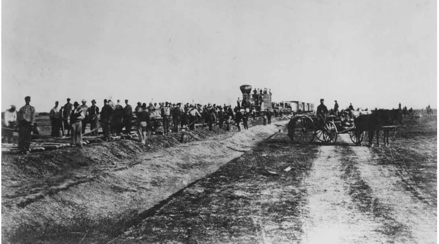
Alexander Gardner took this photograph of workers laying track on the Union Pacific Railroad, Eastern Division, west of Hays, Kansas, dated 1867. When the Kansas Central Railway commenced construction in 1871, the track construction crew consisted of men of mostly Swedish and Irish heritage.