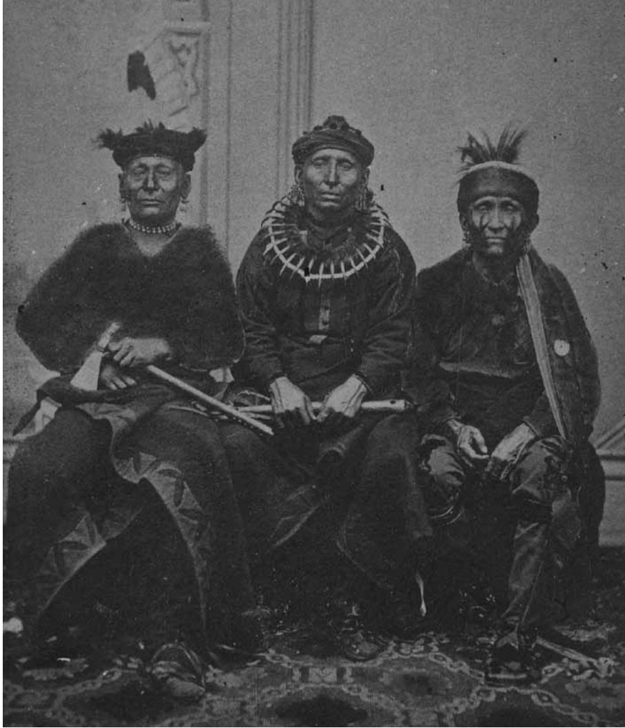
Three unidentified Osage chiefs sit for this photo taken circa 1860s.

The Kansas Historical Society’s “History and Biography” sketch for the state’s sixth chief executive observes that “the promotion of continued colonizing and land settlements and the encouragement of settlers to permanently homestead was the Governor’s highest priority.” Later in life, Osborn strove to enshrine the pioneer legacy of his generation and became president of the Kansas Historical Society in 1890. 5 However, in 1873, the buoyant optimism and expansionist confidence with which Osborn and fellow Republicans had sailed into office dissipated in the midst of escalating crises. To clearly interpret the acrimonious arguments that erupted in the wake of the Osage Border War, one must recognize the sharp partisan divisions within the state. Osborn’s policy agenda cannot be separated from his personal political ambition and his determination to vanquish his reformist opponents in the coming 1874 gubernatorial contest—and in the races to follow. Hitching his electoral fortunes to support for struggling frontier colonists, the governor exploited the existing fear and hatred of Native Americans and vented unjust abuse upon the Osage Nation. It was, Osage historian Louis F. Burns noted dryly, “surely not the finest hour in Kansas history.” 6 A century and a half later, clashing versions of the related events are still repeated, but a logical weighing of evidence supports the general conclusions of Osborn’s critics and the traditional