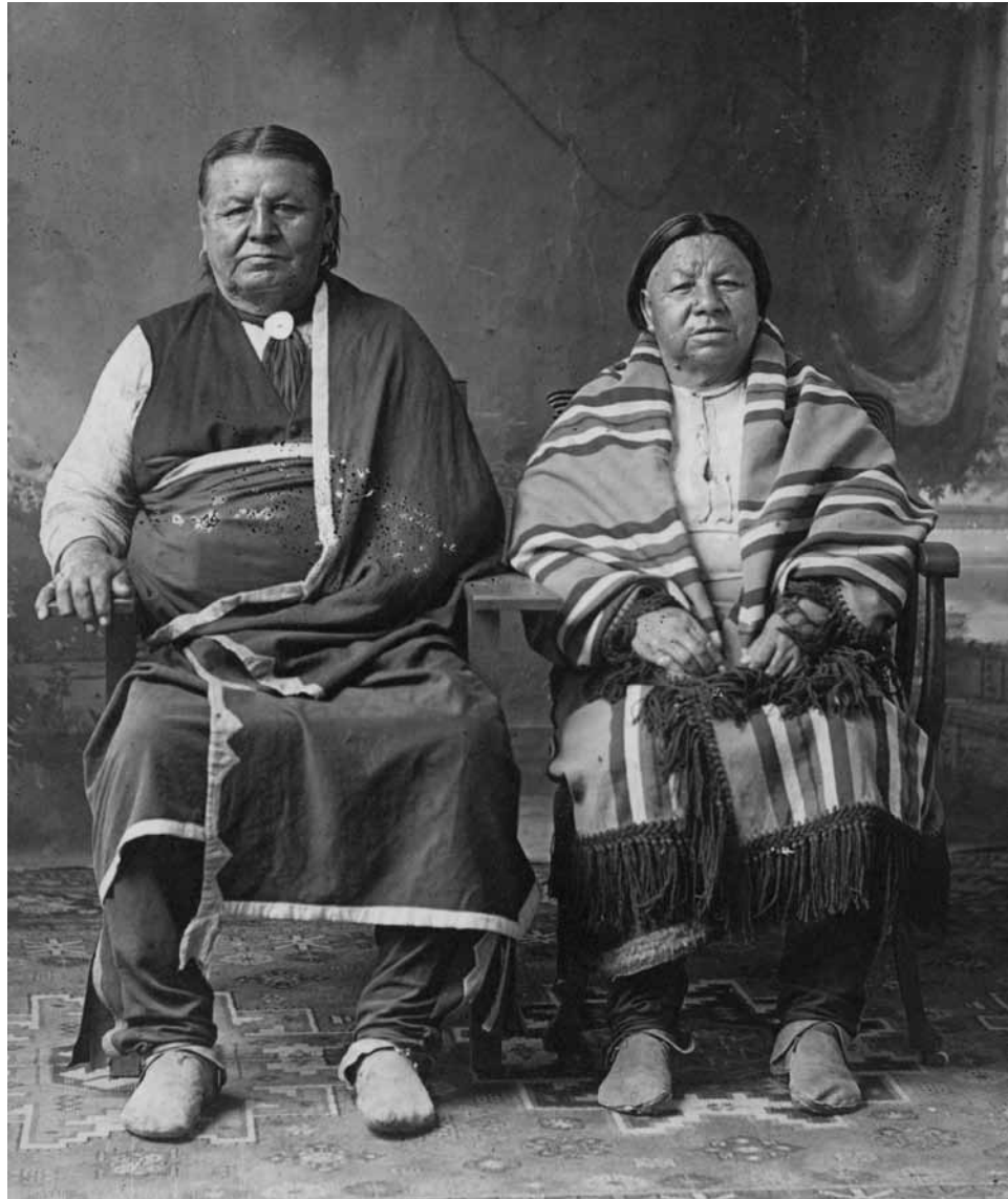
This photo post card of an unidentified Osage man and woman dates between 1870 and 1890.

Press blamed the Cheyennes for the four June murders and reported wide-spread public panic, but it attributed the deaths to “roving bands without concert of action.” The editor maintained that “the fear of an Indian war upon our frontier is groundless, and no one need apprehend any more danger than though he or she was living in the heart of Pennsylvania.” “Absurd rumors” had been “set afloat by foolish persons,” and frightened settlers had abandoned their farms and fled to the newly fortified towns of Kiowa and Medicine Lodge. Armed scouting parties in Barber County now had the situation in hand, and the alerted inhabitants appeared to be as safe as “the people of Ohio or Indiana.” 12 On that same day, the Topeka Weekly Commonwealth suggested that a company of a hundred “old plainsmen” with their “thorough knowledge of the country” would be “effective in check-mating any hostile designs of the Indians.” Despite the militant headline “From the Front,” the general tone was one of rebounding confidence and returning calm. 13